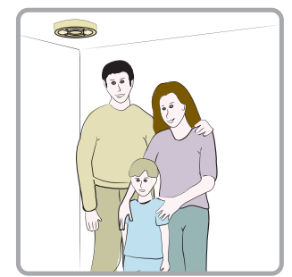
CHIRPING: When the battery is full, your smoke alarm makes a loud steady warning sound when smoke is present. When the battery is low, it makes a short chirp or beep every few minutes. When you hear the chirp, change the batteries.