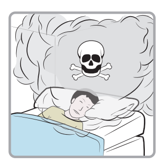
SILENT SMOKE KILLS: Most people think the sound of the fire will wake them, but it's the smoke that kills—not the fire.